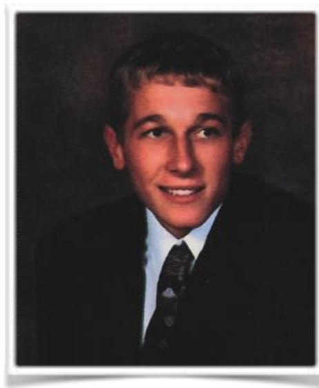
High School Senior - 1999

weaknesses to a few gifts God might be able to use with some time and practice. What if they had simply shut me down until I grew up? What if they had been unable to get passed the rough edges or taken offense at my brash teenage self? What if they hadn't had the maturity to listen and to correct? I'm glad they didn't give me the reigns of a church but am grateful they invited me to practice real ministry with real responsibility. May we be a church that is gracious with our younger people, encouraging engagement and responsibility. As we follow this Growing Young path, there will be many "teachable moments," and, God willing, many disciples equipped to carry on Christ's mission.